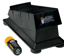
300429 remote shown.