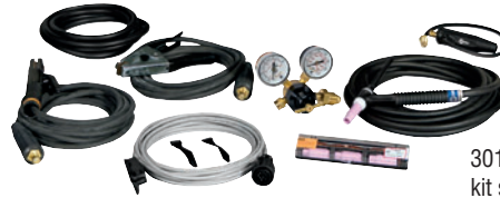
301311 kit shown.