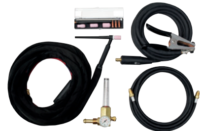
300185 kit shown.