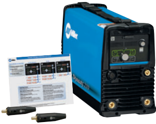
907685 Dynasty shown.

Select desired stock number for each step.