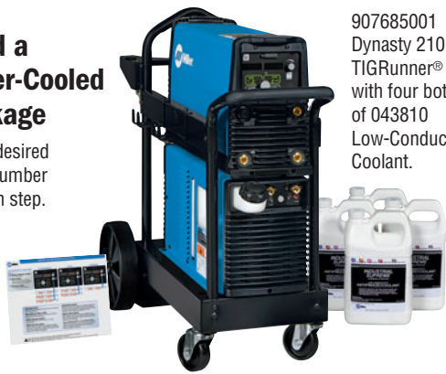
907685001 Dynasty 210 TIGRunner® shown with four bottles of 043810 Low-Conductivity Coolant.

Select desired stock number for each step.