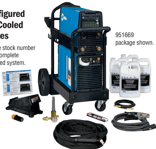
951669 package shown.

Use a single stock number to order a complete preconfigured system.